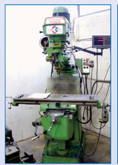
POWERMILL KONDIA FV-1 VERTICAL MILLING MACHINE