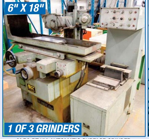
ALPA RT450 AUTOMATIC SURFACE GRINDER