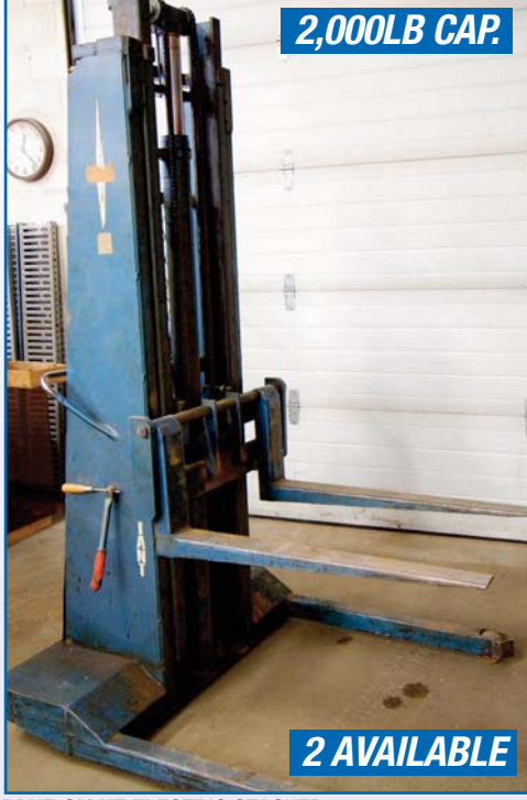
BLUE GIANT ELECTRIC STACKER