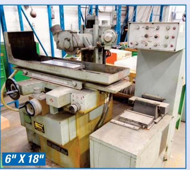
ALPA RT450 AUTOMATIC SURFACE GRINDER