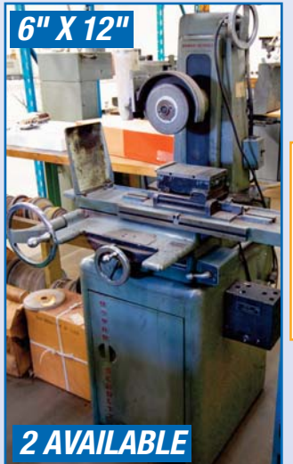
Visit infinityassets.com for complete specs and additional photos